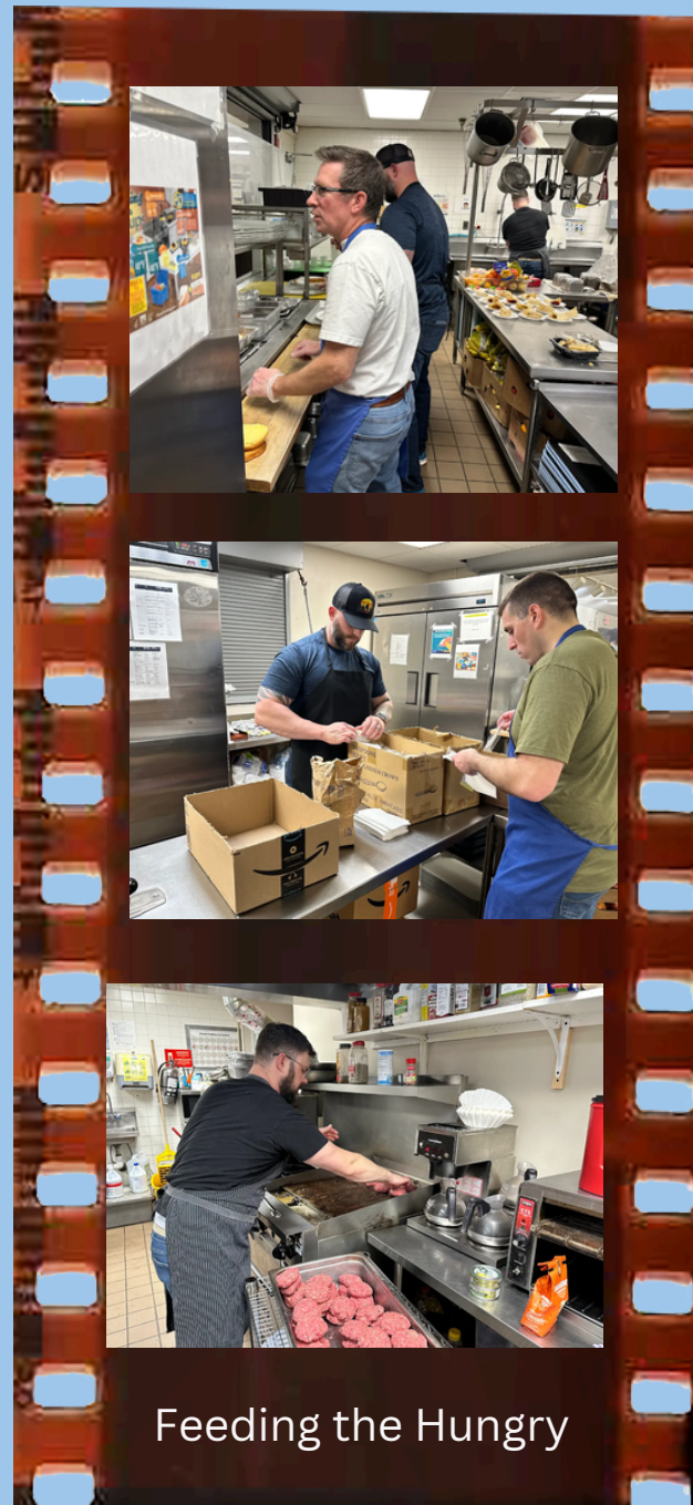
Feeding the Hungry