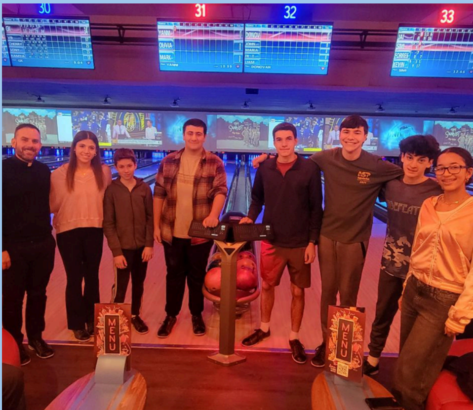
GOYA goes bowling at Bowlero