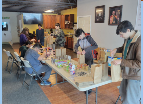
GOYA makes bag lunches for the Loudoun Shelter